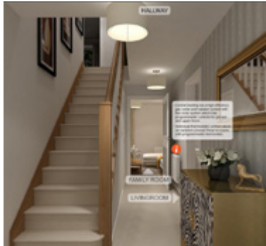
Pixel Image's digital offering enables property developers to benefit from innovative technology platforms across a development's lifecycle