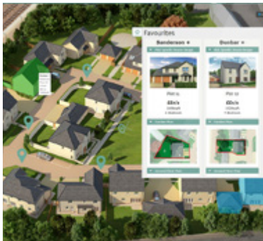
Pixel's Home Selector technology provides plot-specific, detailed content for home buyers to visually interact and engage with