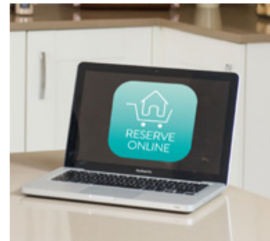
Miller Homes' online home purchasing innovation