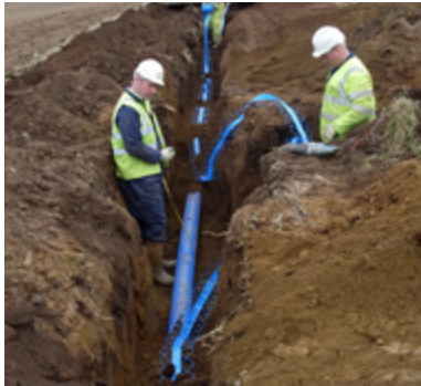
Morrison Construction acts as a conduit between Scottish Water and home builders/developers to facilitate and enable connection to the water network

Those on the shortlist each attended interview with representatives of the judging panel.