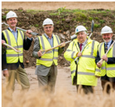
Its Villages concept demonstrates that the Springfield team is thinking about building places, not just homes