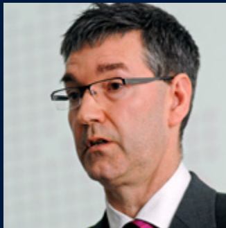
Ian Gilzean Chief Architect, Scottish Government