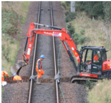
Morrison Construction adds real value to its clients in time and cost savings