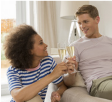
Miller Homes' online purchasing concept allows customers to reserve a home at a time to suit them

Those on the shortlist were all invited to interview by the judges.