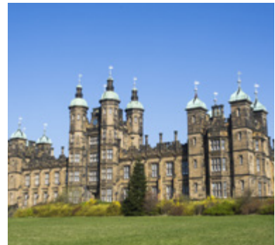
Rettie & Co has new home sales roles on key restoration projects such as the former Donaldson's School for the Deaf.