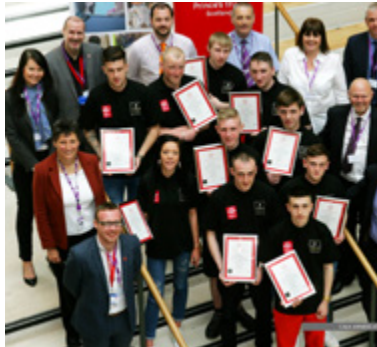
CALA awards at City of Glasgow college