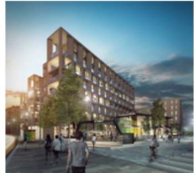
A landmark scheme for Scotland's Build to Rent sector, Rettie & Co advised Moda on the acquisition of the Fountainbridge development site