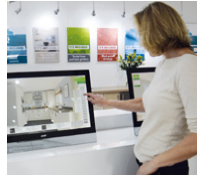
The Choices Interactive online tool as demonstrated at Springfield's sale office