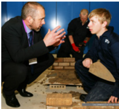
A CALA apprentice in training at City of Glasgow College